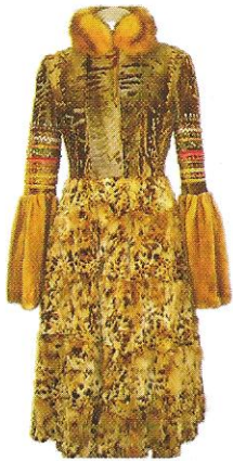
Dennis Basso lipi cat, lynx, mink and sable coat, $18,000