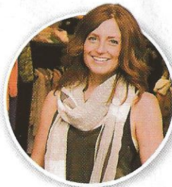
[2424 Dunstan; 713-522-7602; benjys.com] has the best short ribs, hands down."

At 1735 Post Oak Blvd.; thelittlebirdinc.com.